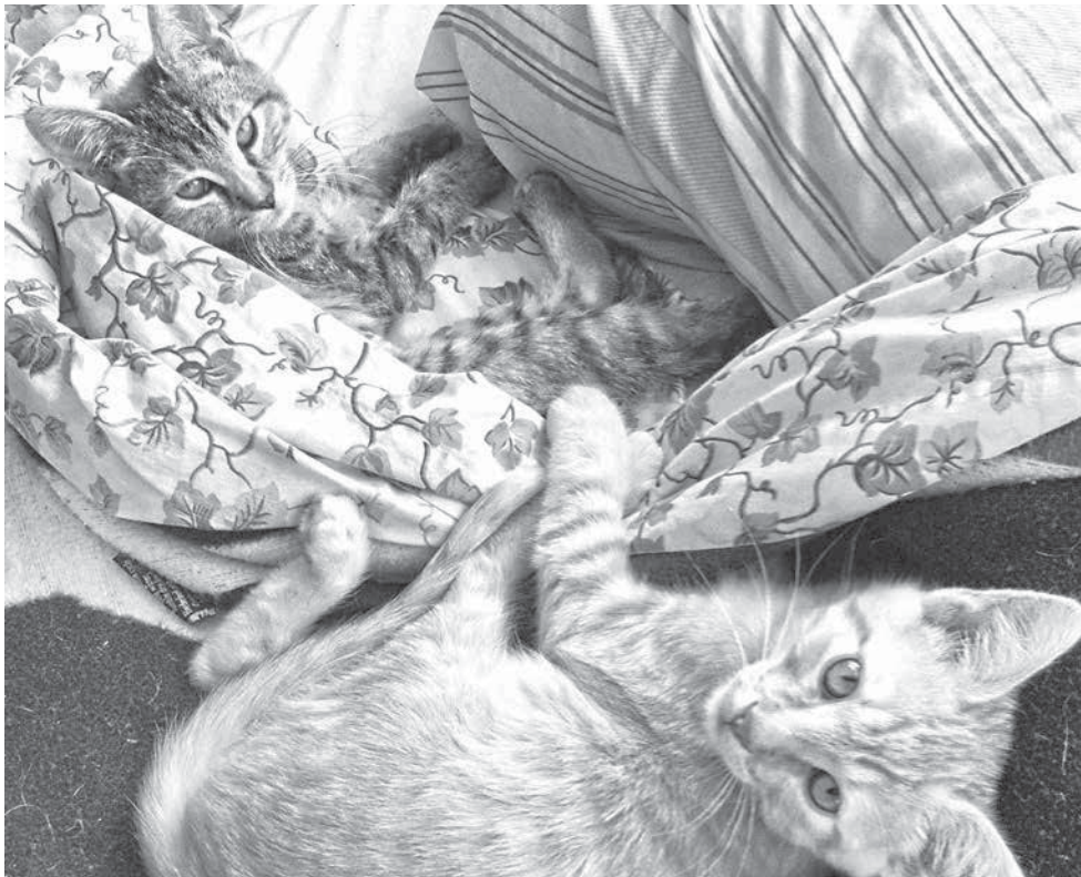
T’Pol and Archer

T’Pol is a happy, thriving kitten with the cutest orange spot on the top of her head. If you look closely at her brown Tabby markings, you can see soft, faint lines of orange/brown that show off her Tortoiseshell side. She adores being stroked and loves to snuggle in blankets and kitty beds. T’Pol is a loving little girl with a lot of spunk and playfulness. She especially likes toys that fit in her mouth, running around